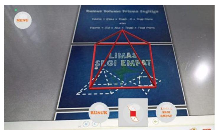
Figure no 3: 3D display of pyramid ribs in the developed AR application