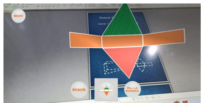
Figure no 2: 3D display of prism nets in the developed AR application

The final product of this research is a compilation of AR-based geometry learning media that has undergone revisions through input from validators. The developed product consists of AR media titled "Recognizing Spatial Shapes" equipped with AR cards and a guide to using the developed media.